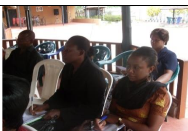
A cross-section of participants