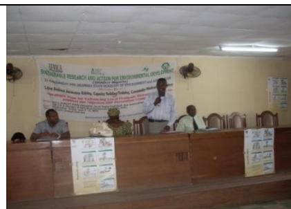
Perm. Sec., Ministry of Agric. during his opening remark