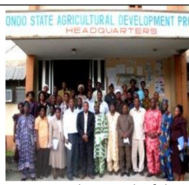
A group photograph of the participants.