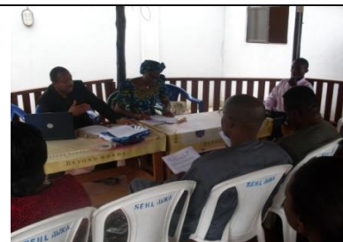
A cross-section of participants