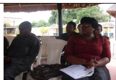
A cross-section of participants