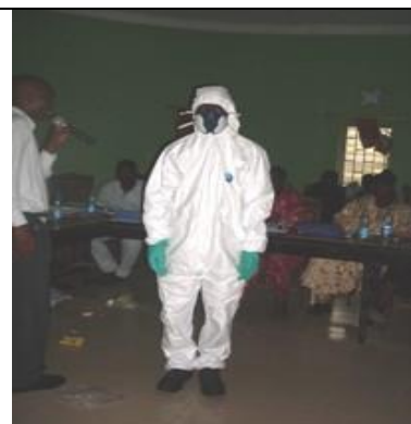
Demonstration of a storekeeper properly dressed in his Personal Protective Wear