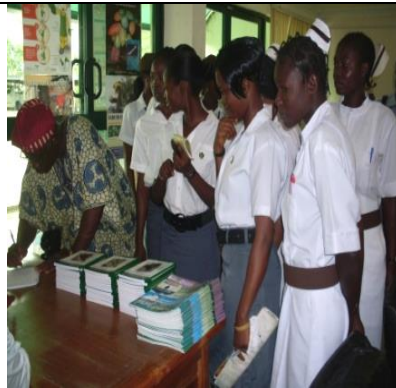
Registration by participants