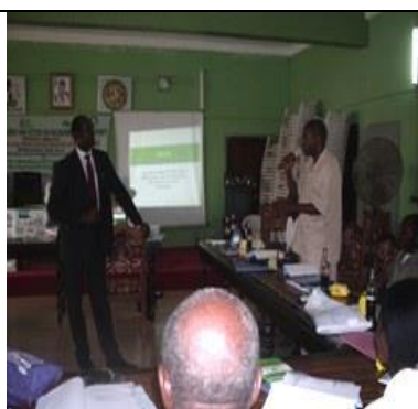
A question/answer/discussion session