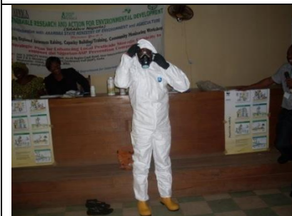
A demonstration of PPE usage by one participant