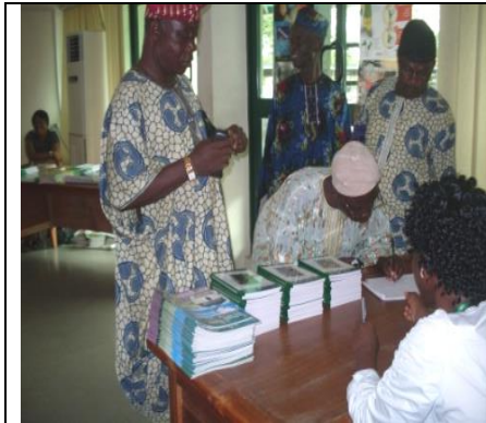
Registration by participants