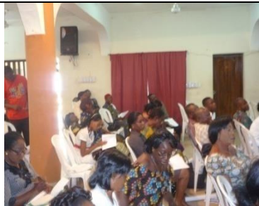
A cross-section of participants