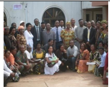
A group photograph of the participants