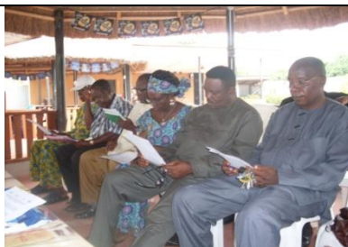
A cross-section of participants.