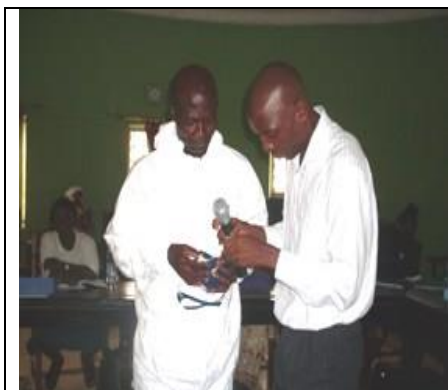
A demonstration of well kitted storekeeper.