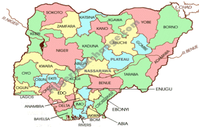
Figure 1: Map of Nigeria showing the three project high risk states

In the West, Ondo State was selected based on its high numbers of stores associated with poor management, high pesticides consumption rate, proximity to importation channels, extensive agricultural (small scale/large scale farming) activities, with other considerations. In the East, Anambra State which has few public stores, but large private stores due to its industrial and commercial hub nature where a lot of packaging, repackaging and adulteration take place, besides the stores are poorly managed and its high pesticides usage, absence of any previous awareness activity, poor store/stocks condition, absence of any regulatory/monitoring activity.