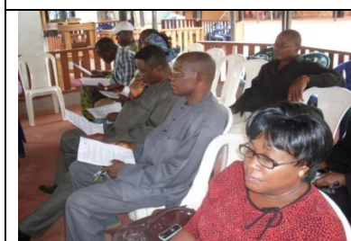
A cross-section of participants