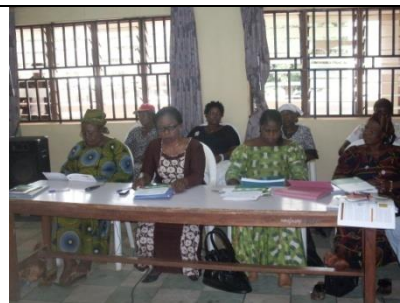
A cross-section of participants