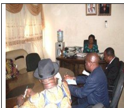
A cross-section of the monitoring group during the meeting.