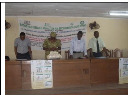
The workshop commenced with prayer