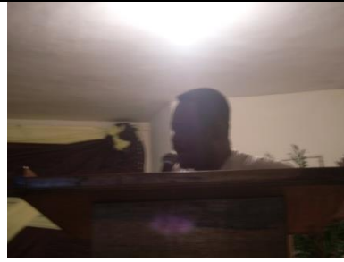
The President of the Agro-chemical Dealers giving his speech