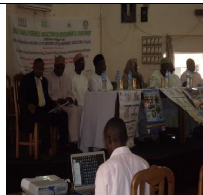
The members of the High table