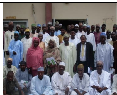
A Group photograph of participants