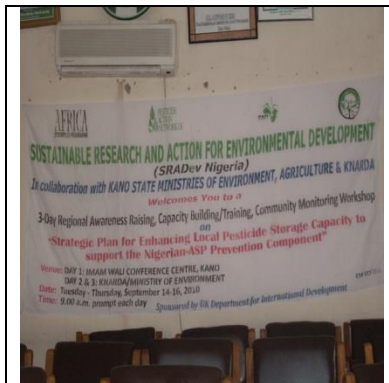
The Workshop's banner