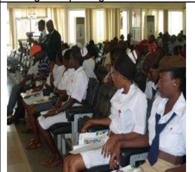
A cross-section of participants from Ondo State School of Health