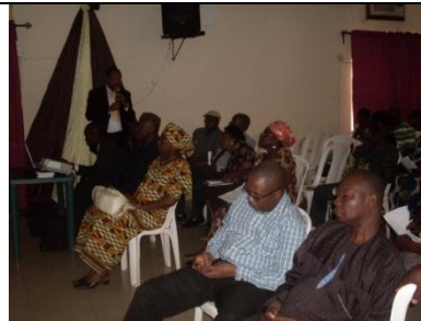
A cross-section of participants