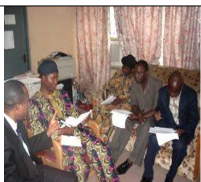
A cross-section of the monitoring group.